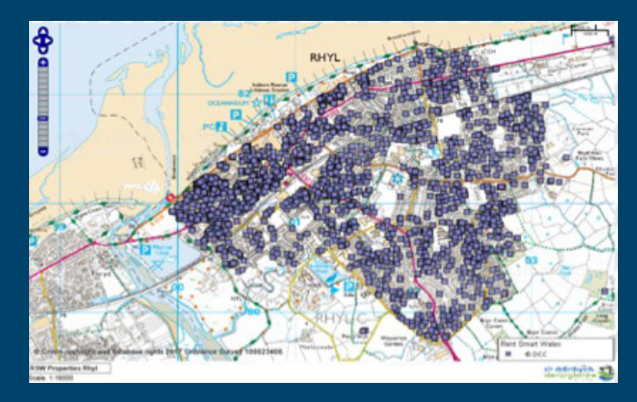
UPRNs identify rented properties in the area

With that authoritative list, Denbighshire County Council was able to secure funding with a capital value of around £377,650 from an Energy Company Obligation (ECO) provider. This meant all of these tenants' housing conditions could be improved at little or no cost to the landlords.