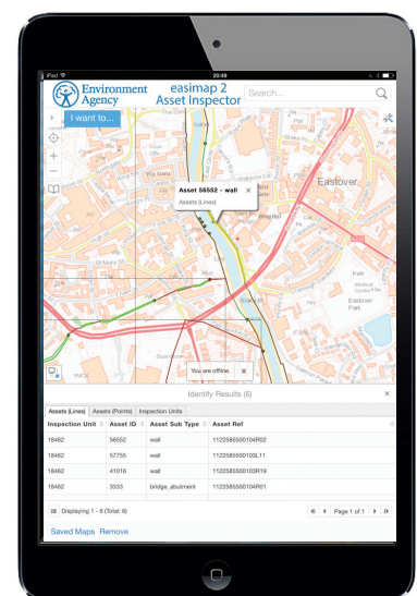
Figure1: While out in the field, the iPad mapping solution has been zoomed to the right area using the GPS locator button. Now using the Identify option via the “I want to...” menu, the field engineer has identified an area of interest by dragging a rectangle area of interest on the map with their finger. Three types of flood defences for that area have been found and are shown in a tabular form at the bottom of the screen.

In mid-February, the government announced that military engineers would be deployed to assist the Environment Agency. 250 engineers from the navy, army, RAF and Royal Marines would conduct a “rapid inspection” of the nation's 150,000 most critical flood defence assets to assess damage. These assets range from 15 – 20 kilometre long embankments to single sluice gates or outfalls. Defence Secretary Philip Hammond stated that, “we're going to try and do in five weeks what would be about a two-year programme of inspection.”