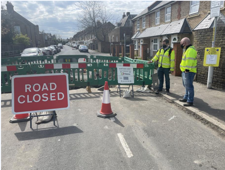
ROAD CLOSURE & PERMIT BOARD