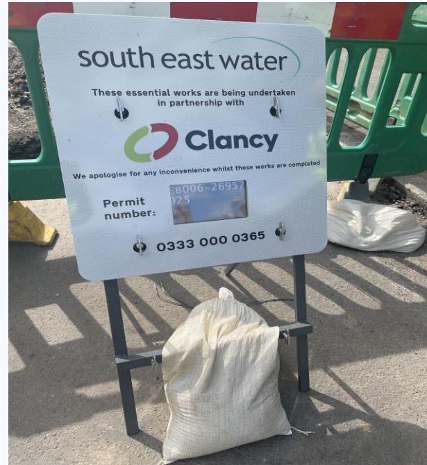
PERMIT BOARD CLOSE UP