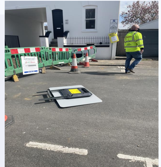
TESTING TILT ALARM